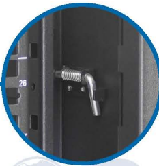
L Tower Bolt Lock Inside