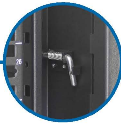
L Tower Bolt Lock Inside