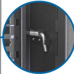
L Tower Bolt Lock Inside